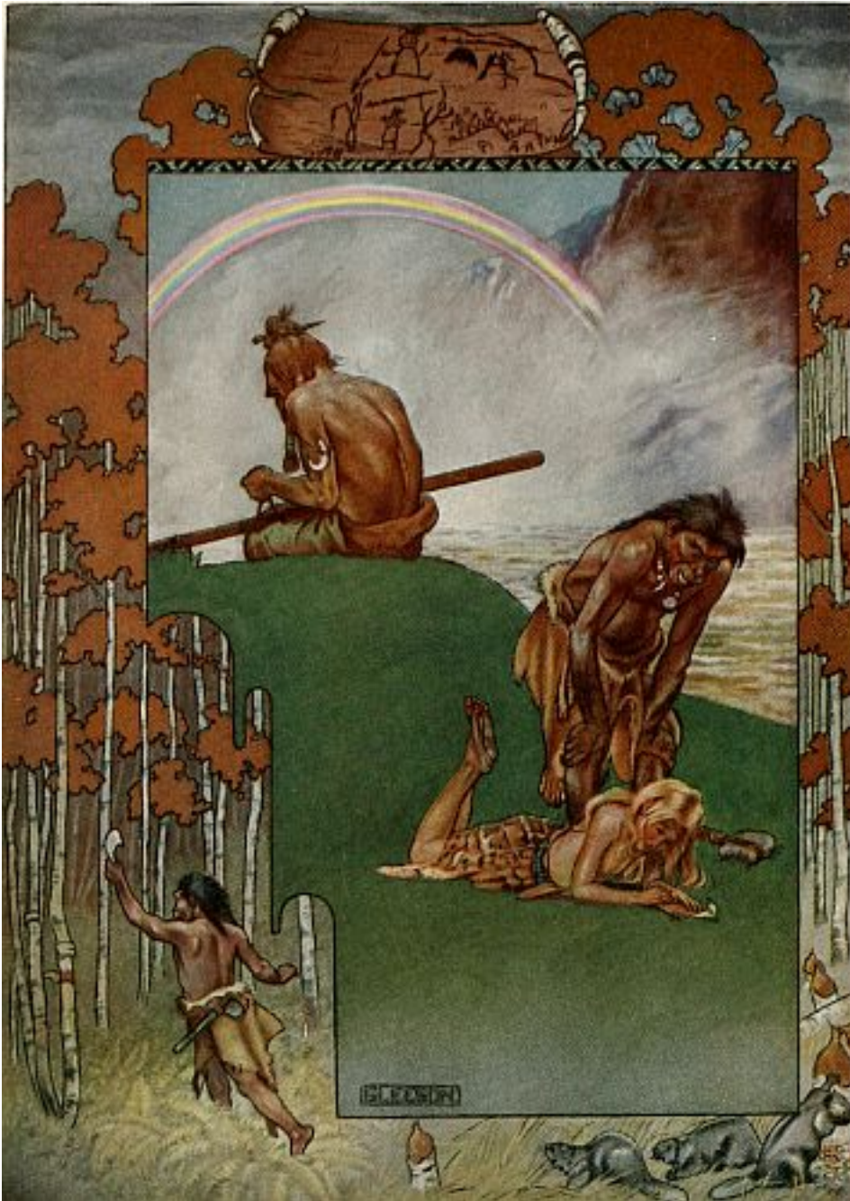
How the First