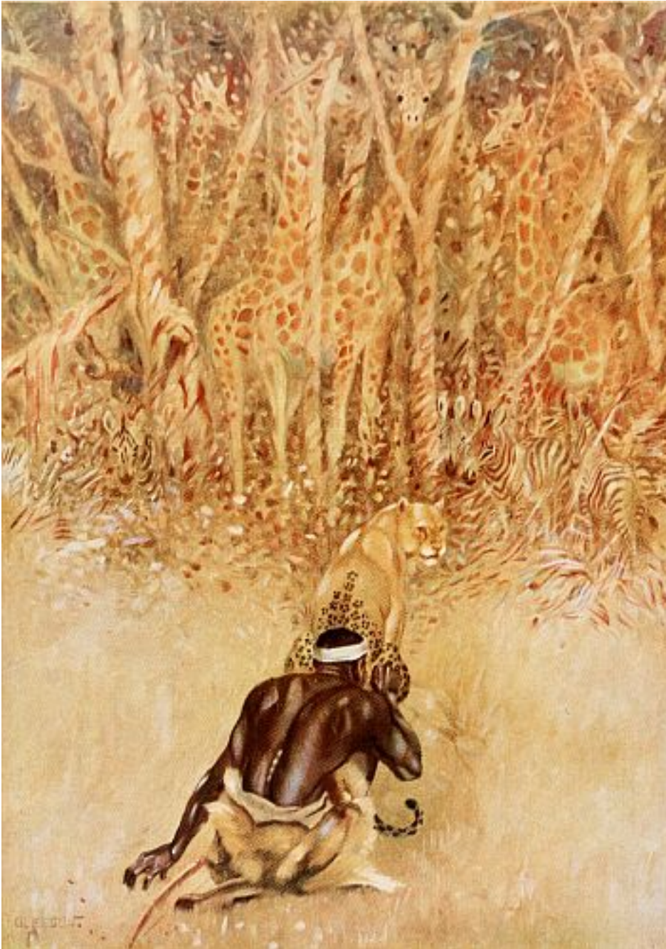
How the Leopard